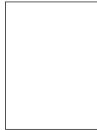
PC Ellie Porter